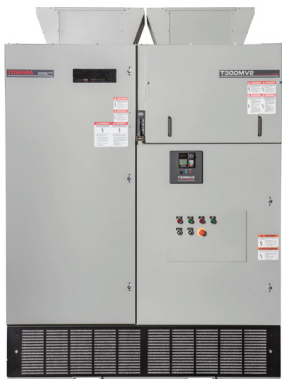
T300MV2 - 2400 V

** Consult Factory on UL status for 3000 HP model