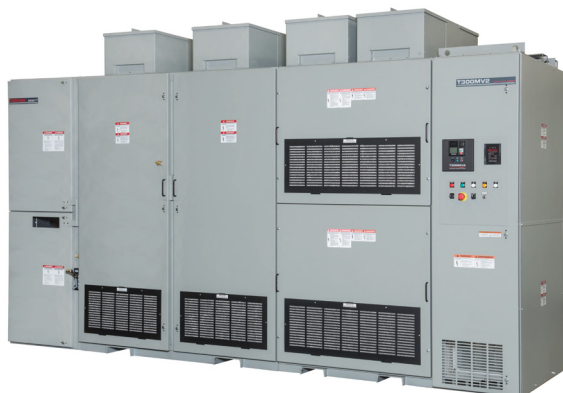
T300MV2 - 6600 V