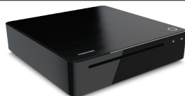
Symbio® BDx5500 Streaming Media and Universal Disc Player