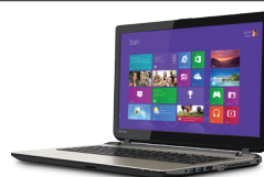
Satellite® L55 Series Laptops