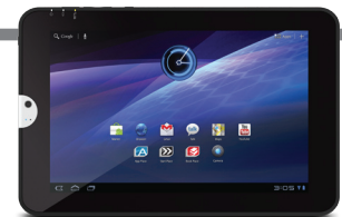
Thrive™ 10" Tablet