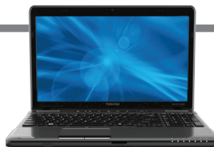
Satellite® P-Series Laptop