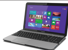
Satellite ® L855-S512