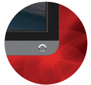
Modern Curved Corner Design with Gun Metal Finish and Sleek Frame Stand

The Toshiba 40" L3400U LED Smart TV combines a new, slim, modern gun metal design, easy connectivity to apps and personal content, with advanced picture quality—all in a sleek, elegant package. The L3400U complements any room and is equipped with 1080p Full HD, a powerful new CQ Dual Core Engine for video processing and ClearScan® 120Hz technologies—perfect for cinema-like entertainment and fast-paced gaming. With all the advantages of a connected Smart TV experience, you'll enjoy access to content on your home network with MediaShare. Also access key media apps including Netflix® and YouTube™, all controlled by an easy-to-navigate interface that displays all your content in one place.