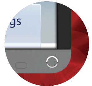
All-new, modern curved corner design with an elegant gun metal finish and thin metal stand

Display the small screen content on the big screen quickly and easily