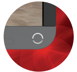
Modern Curved Corner Design with Gun Metal Finish and Sleek Stand

Easily connect to your favorite tunes and photos, create slideshows or listen to your personal playlists