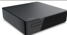
Symbio ™ BDX3500 Streaming Media and Universal Disc Player