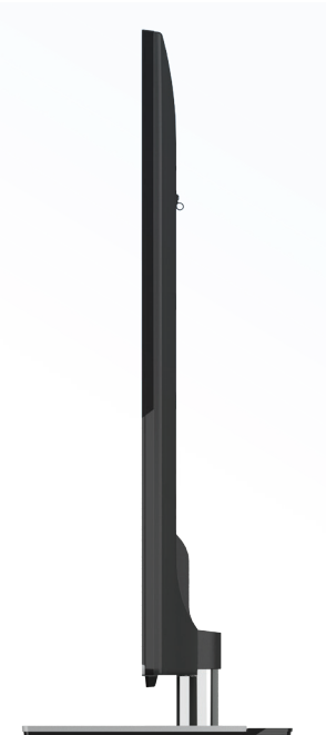
Ultra-slim sophisticated gun metal design, thin bezel and sleek frame stand

Display the small screen content on the big screen quickly and easily