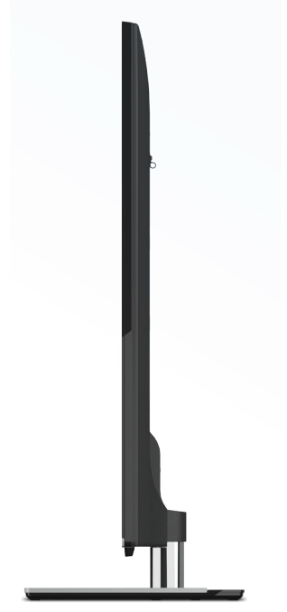
Ultra-slim sophisticated gun metal design, thin bezel and sleek frame stand

Display the small screen content on the big screen quickly and easily