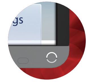
All-new, modern curved corner design with an elegant gun metal finish and thin metal stand

Display the small screen content on the big screen quickly and easily