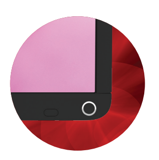
All-new, modern curved corner design in high gloss black with metal neck.

Cinema Mode for film-like quality movies