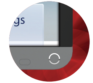
All-new, modern curved corner design with an elegant gun metal finish and thin metal stand

Display the small screen content on the big screen quickly and easily