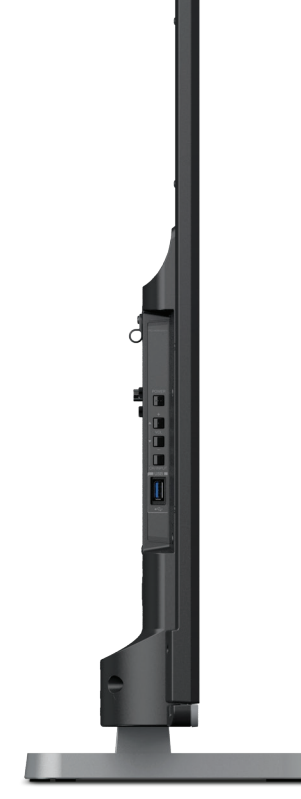
Slim Modern Design with Gun Metal Finish and Sleek Frame Stand

Easily connect to your favorite tunes and photos, create slideshows or listen to your personal playlists