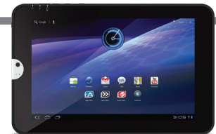
Thrive™ 10" Tablet