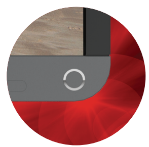
Modern Curved Corner Design with Gun Metal Finish and Sleek Stand