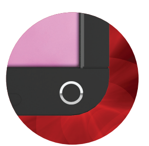
All-new, modern curved corner design in high gloss black with metal neck.

Easily connect your PC to your TV for the big screen experience